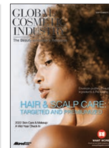
Final Cover Image - Enlarged and cropped.