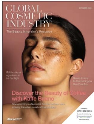
Optional Cover Branding - Corner