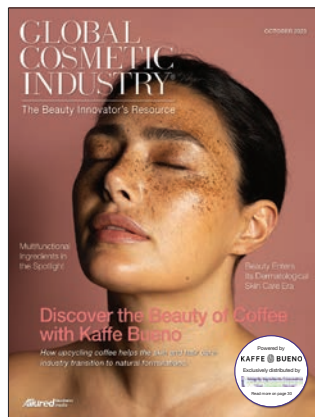
Optional Cover Branding - Circle