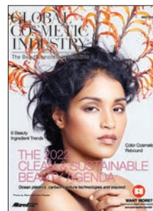
Final Cover Image - Enlarged and cropped.