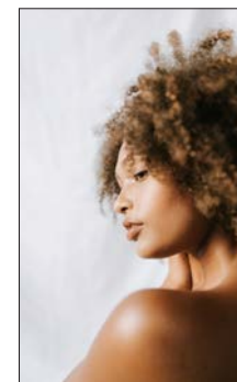
Original Image →