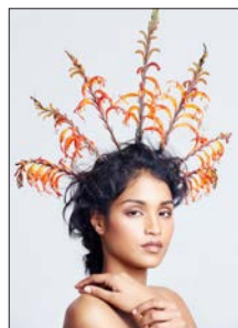
Original Image →

Designers work with the scale and crop of each image to arrive at a final cover. Examples below show original images and how they can be manipulated for use on a cover. All covers are vertically oriented.