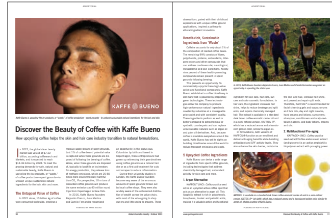
Example 4-Page Folio (this gets converted into a web exclusive)