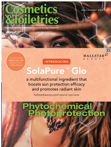
Digital Belly Band