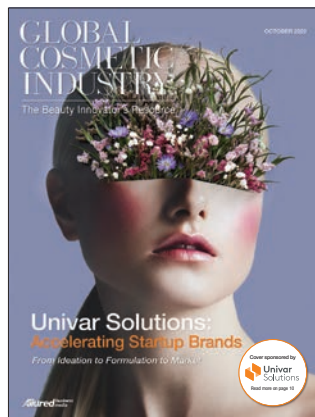
Optional Cover Branding - Circle