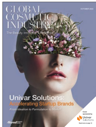
Optional Cover Branding - Corner