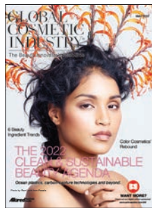
Original Image → Final Cover Image - Enlarged and cropped.