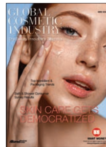
Original Image → Final Cover Image - Enlarged and cropped to fit a vertically oriented cover.