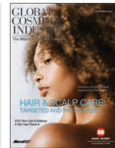
Original Image → Final Cover Image - Enlarged and cropped.