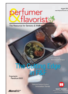
Final Cover Image - Enlarged, cropped and brightened.