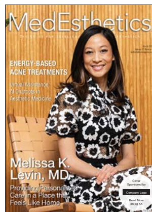
Optional Cover Branding - Circle