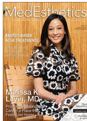
Optional Cover Branding - Corner