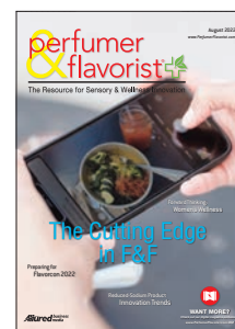
Final Cover Image - Enlarged, cropped and brightened.