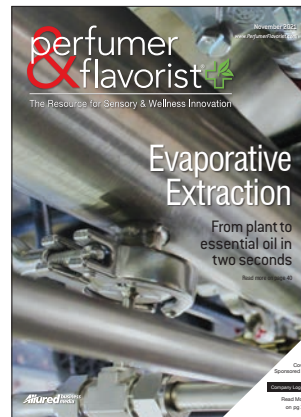
Optional Cover Branding - Corner