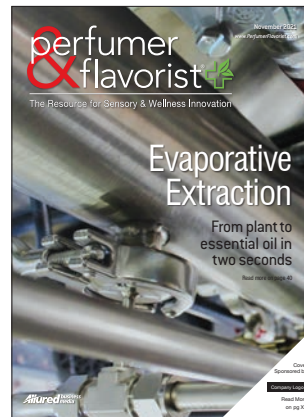
Optional Cover Branding - Corner