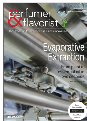
Optional Cover Branding - Circle