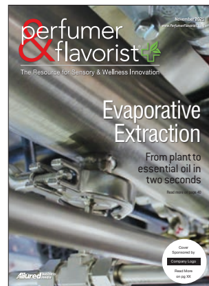
Optional Cover Branding - Circle