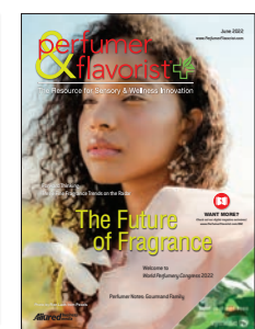
Final Cover Image - Enlarged and cropped to fit vertical format.