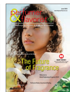
Final Cover Image - Enlarged and cropped to fit vertical format.