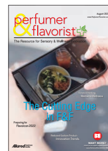
Final Cover Image - Enlarged, cropped and brightened.