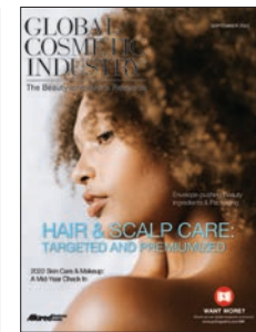
Original Image → Final Cover Image - Enlarged and cropped.