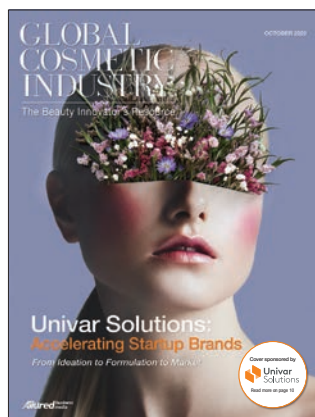
Optional Cover Branding - Circle