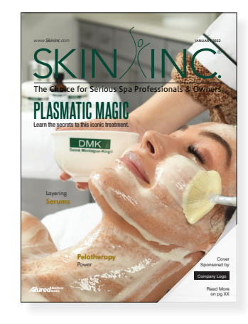
Optional Cover Branding - Corner