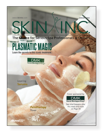
Optional Cover Branding - Circle