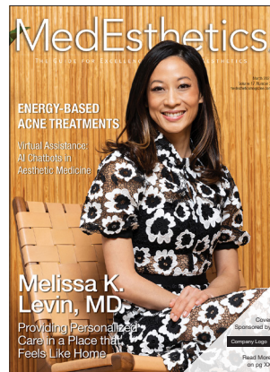
Optional Cover Branding - Corner