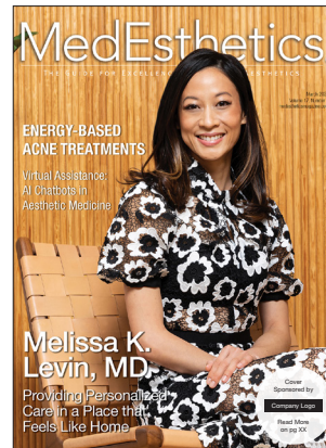
Optional Cover Branding - Circle