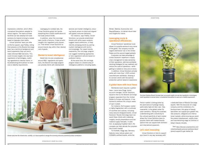
Example 4-Page Folio