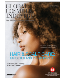
Original Image → Final Cover Image - Enlarged and cropped.