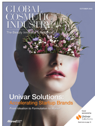
Optional Cover Branding - Corner