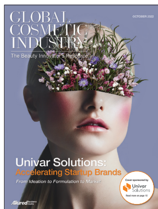
Optional Cover Branding - Circle