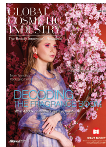
Original Image → Final Cover Image - Enlarged and cropped to fit a vertically oriented cover.