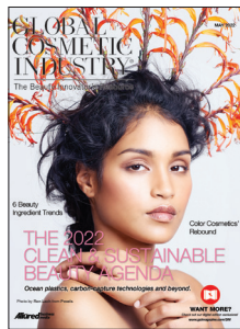
Original Image → Final Cover Image - Enlarged and cropped.