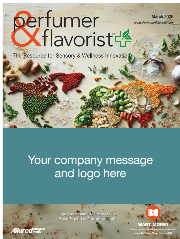
Digital Belly Band