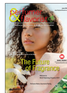
Final Cover Image - Enlarged and cropped to fit vertical format.