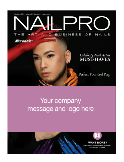
Digital Belly Band