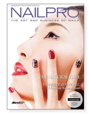
Optional Cover Branding - Circle