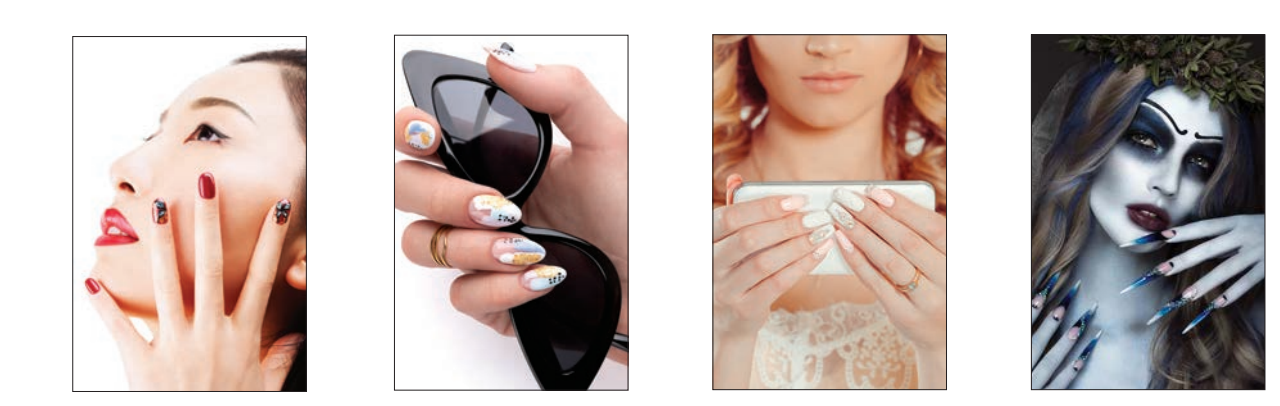
All cover images need to be vertically oriented when possible.

Designers work with the scale and crop of each image to arrive at a final cover. Examples below show original images and how they can be manipulated for use on a cover. All covers are vertically oriented.