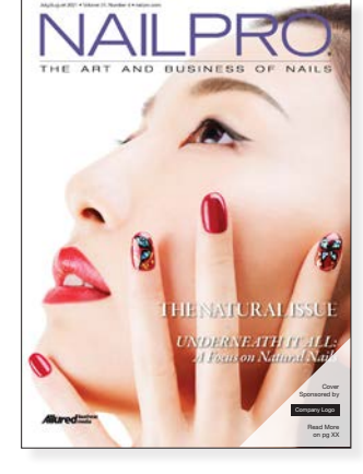
Optional Cover Branding - Corner