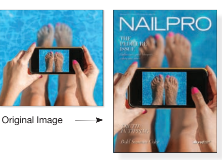
Final Cover Image -Enlarged and cropped.