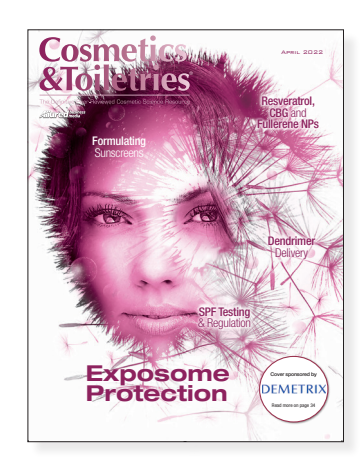
Optional Cover Branding - Circle