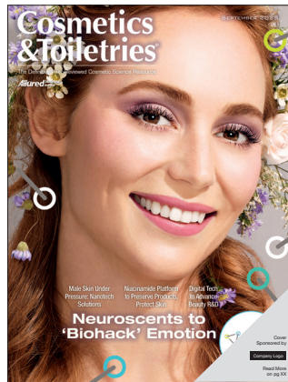
Optional Cover Branding—Corner