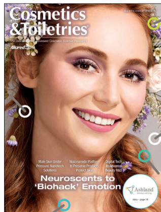
Optional Cover Branding—Circle