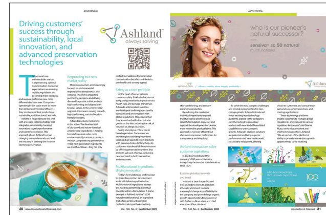
Example 4-Page Folio)