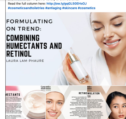
Formulating On Trend Post