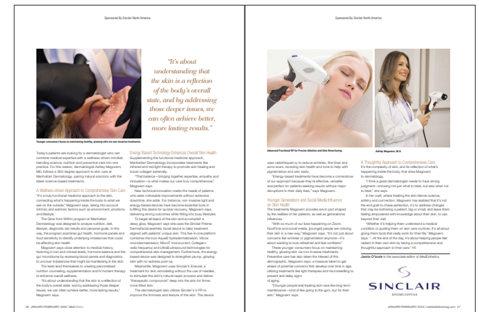
Example 4-Page Folio