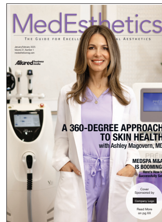
Optional Cover Branding—Circle