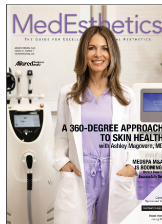
Optional Cover Branding—Corner