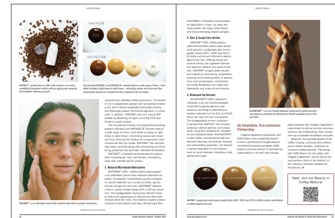
Example 4-Page Folio (this gets converted into a web exclusive)