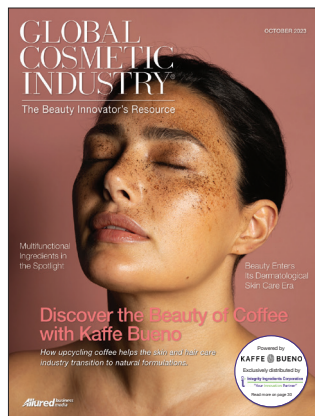
Optional Cover Branding—Circle