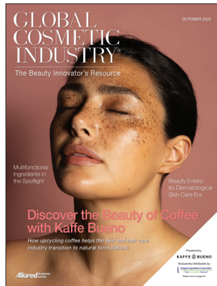
Optional Cover Branding—Corner